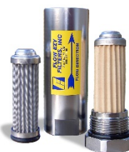
IL Series Filters

Our 6IL and 15IL series in-line filters are made for high pressure applications. For up to 1500 psi working pressure use the ILA series with anodized aluminum housing. For pressures up to 3000 psi, use our steel or stainless steel housing. These are used for flow rates up to 15 gpm with filter elements rated from 5 micron cellulose to 595 micron stainless steel wire cloth. Filter