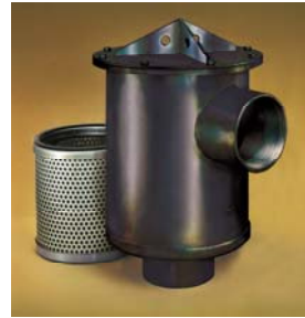
Flow Ezy Texas Filter

In-line filters with flow rates up to 400 gpm, can be used in "up-flow" or "down-flow" applications. Rated to 150 psi. Filtration levels from 25 micron to 595 mi-cron. Can be used for suction or return line applications. Please look at the dia-grams above to see various positioning options. To go directly to the Texas Filter on our web site, click on the link below.