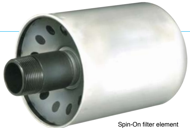
Spin-On filter element