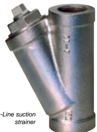
In-Line suction strainer